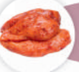
Marinated Chicken breast fillets