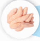
Frozen Chicken inner fillets