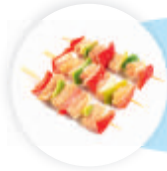
Frozen Chicken Skewers with vegetables 175 g