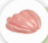
Chicken inner fillets