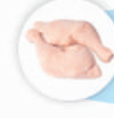
Frozen Chicken Leg Calibrated