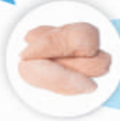
Frozen Chicken breast fillets