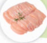
Chicken breast medallions 15 mm