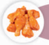
Marinated Chicken Drumstick