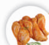
Marinated Chicken Drumstick