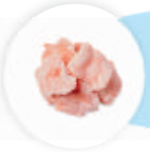
Frozen Chicken Leg meat saute