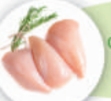
Chicken breast Steaks 125-150-175-200 g