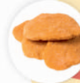
Chicken Schnitzel European