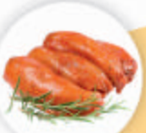
Marinated Chicken breast fillets