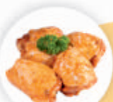
Marinated Chicken Thigh