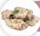
Marinated Chicken Thigh