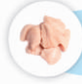
Frozen Chicken breast Cuts Calibrated