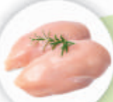
Chicken breast fillets