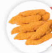
Spicy Breaded Fillet