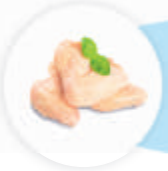
Frozen Chicken 2-joint wing