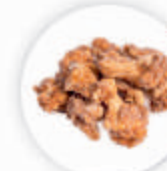
Roasted Wings BBQ